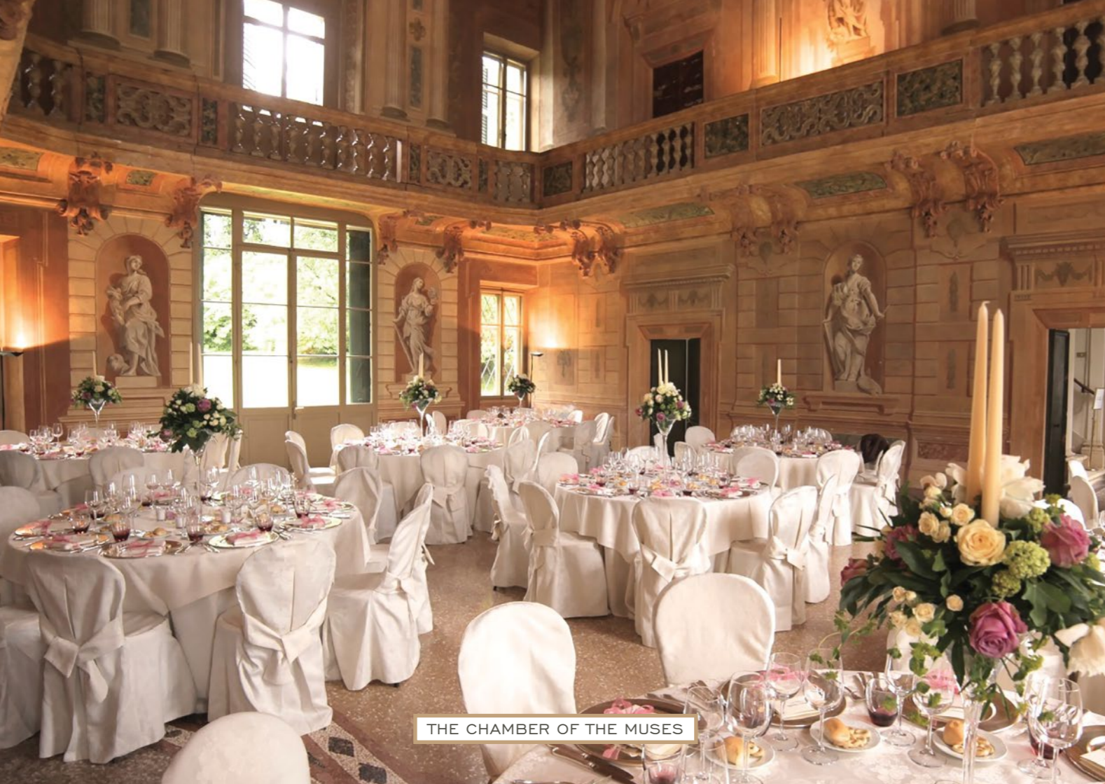
THE CHAMBER OF THE MUSES