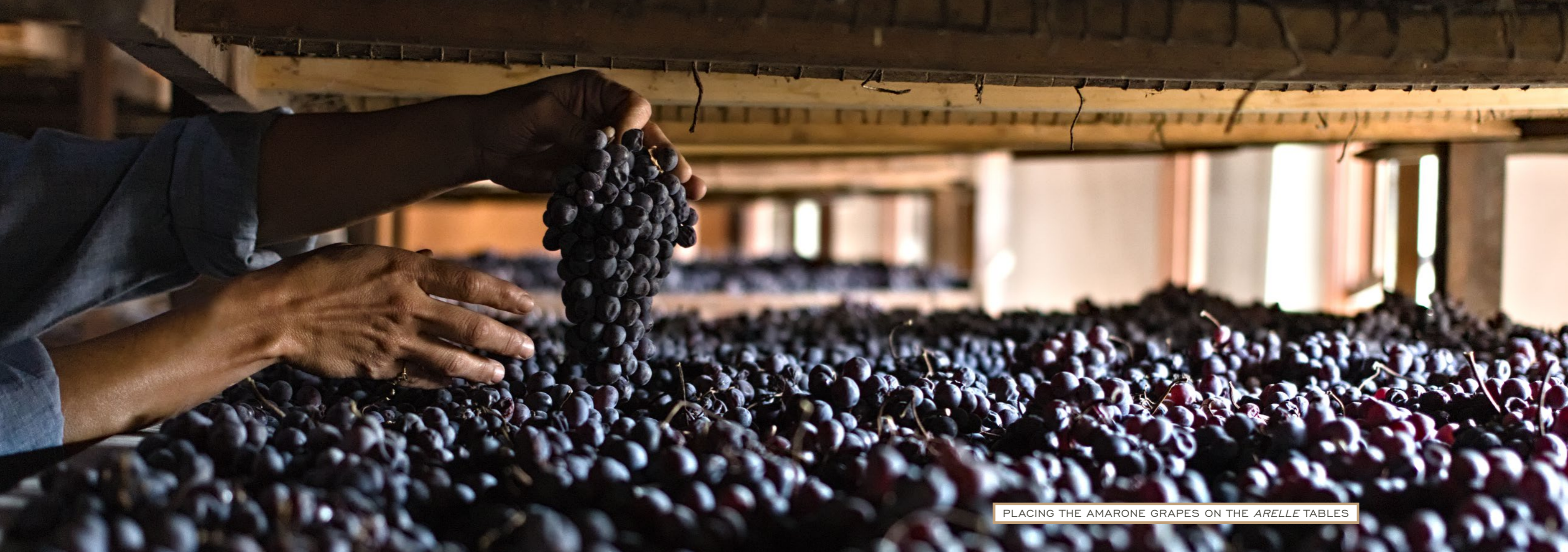
PLACING THE AMARONE GRAPES ON THE ARELLE TABLES