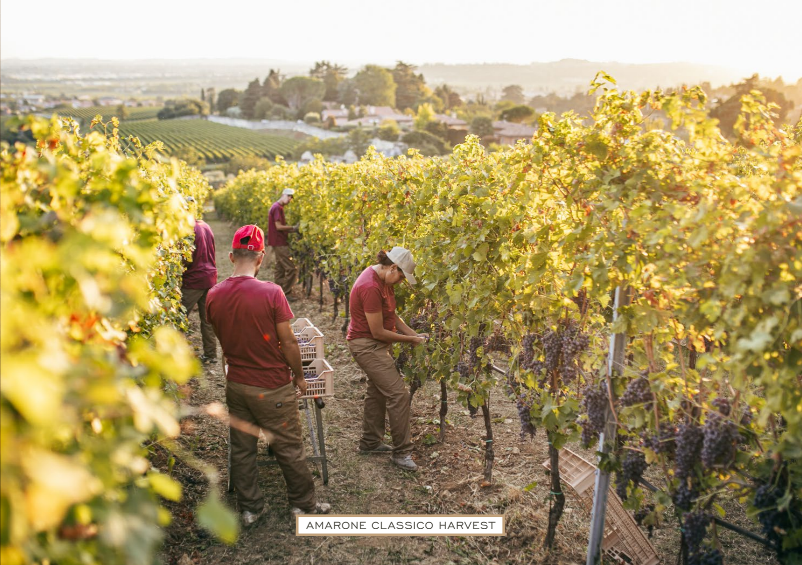
AMARONE CLASSICO HARVEST