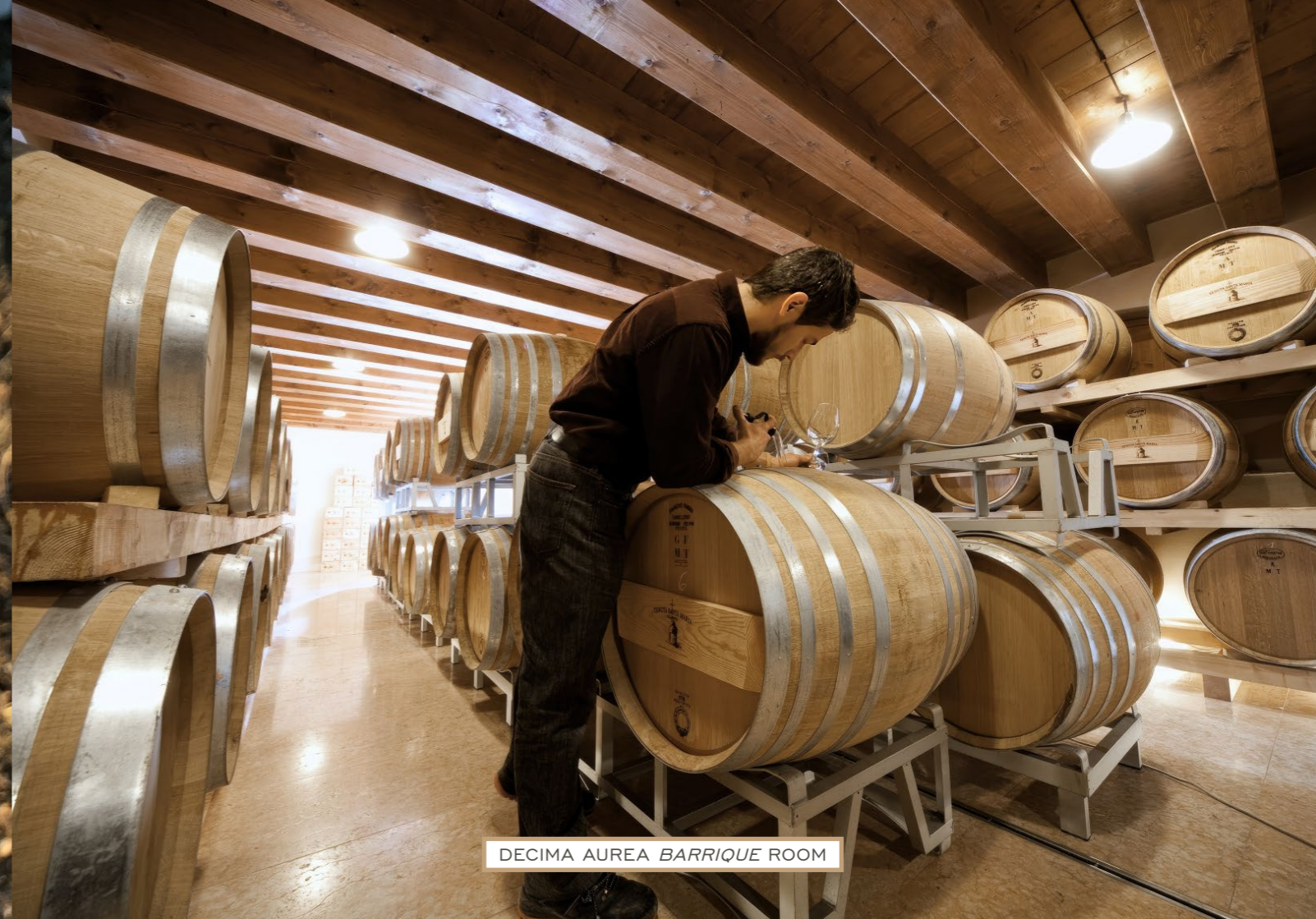
DECIMA AUREA BARRIQUE ROOM