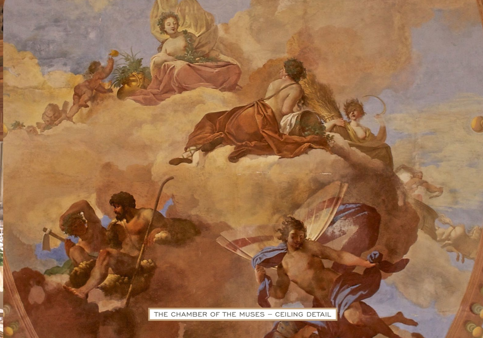
THE CHAMBER OF THE MUSES – CEILING DETAIL