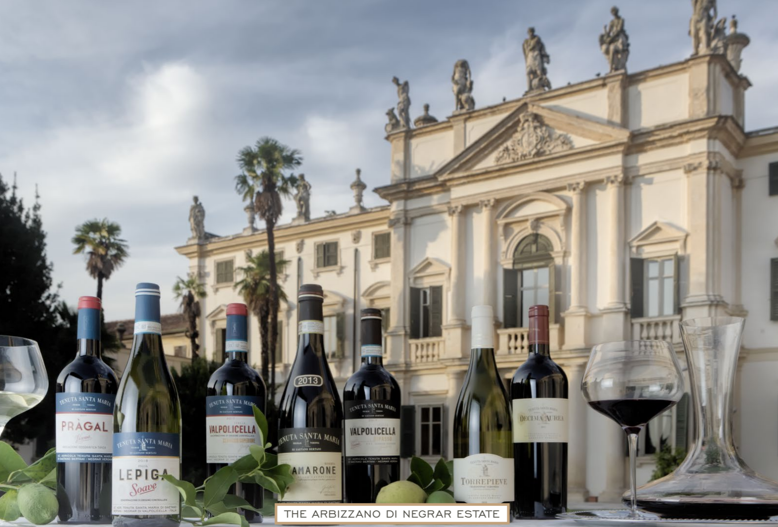
THE ARBIZZANO DI NEGRAR ESTATE