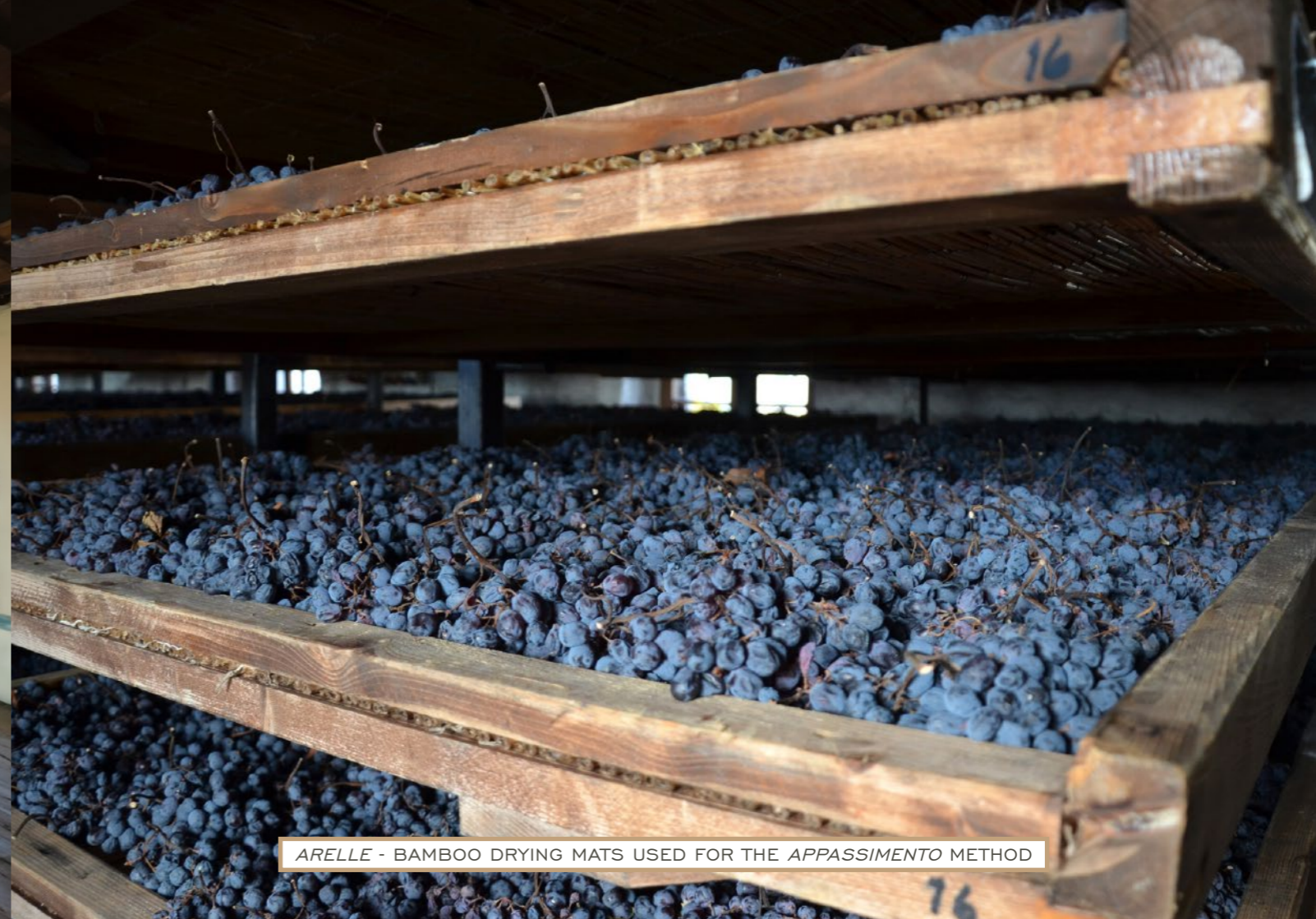
ARELLE - BAMBOO DRYING MATS USED FOR THE APPASSIMENTO METHOD