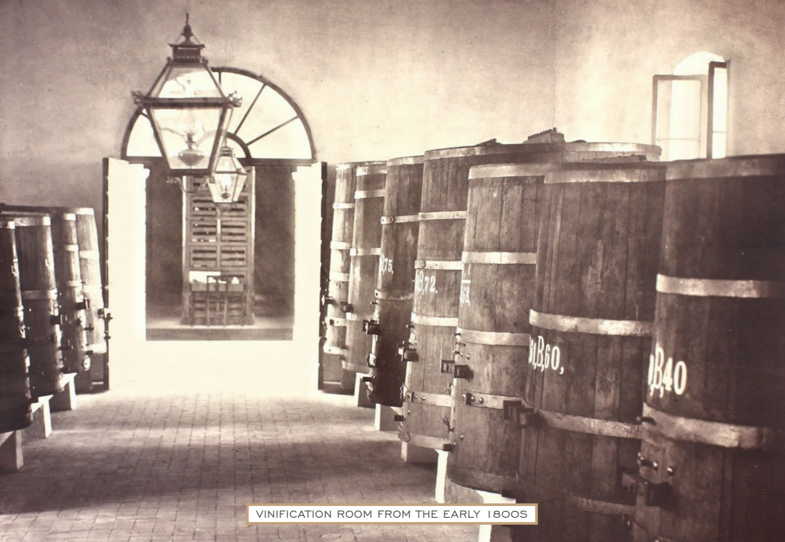
VINIFICATION ROOM FROM THE EARLY 1800S