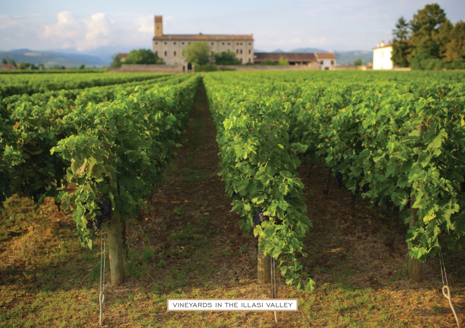
VINEYARDS IN THE ILLASI VALLEY