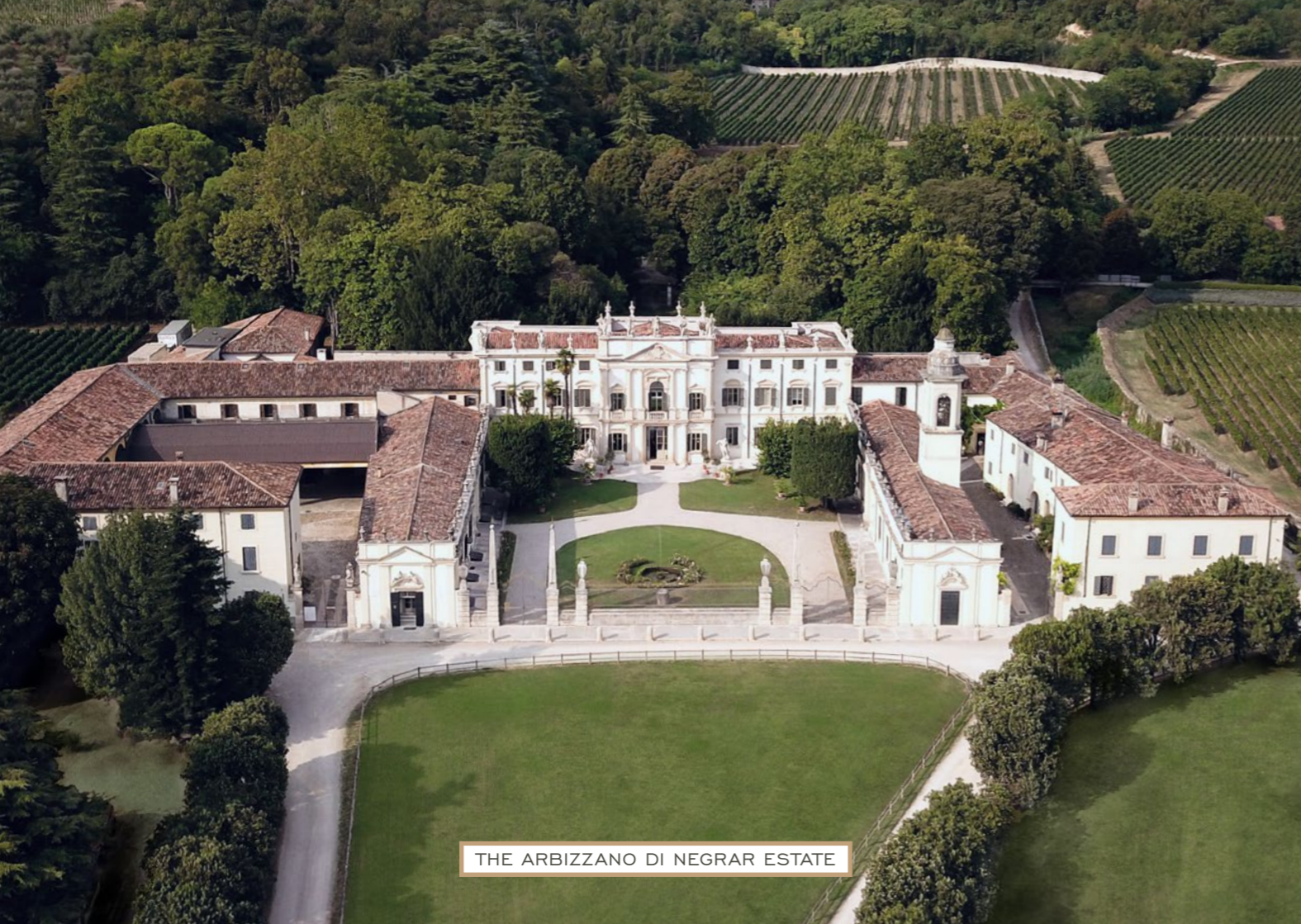
THE ARBIZZANO DI NEGRAR ESTATE