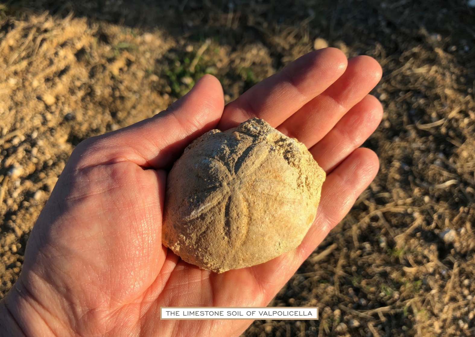
THE LIMESTONE SOIL OF VALPOLICELLA