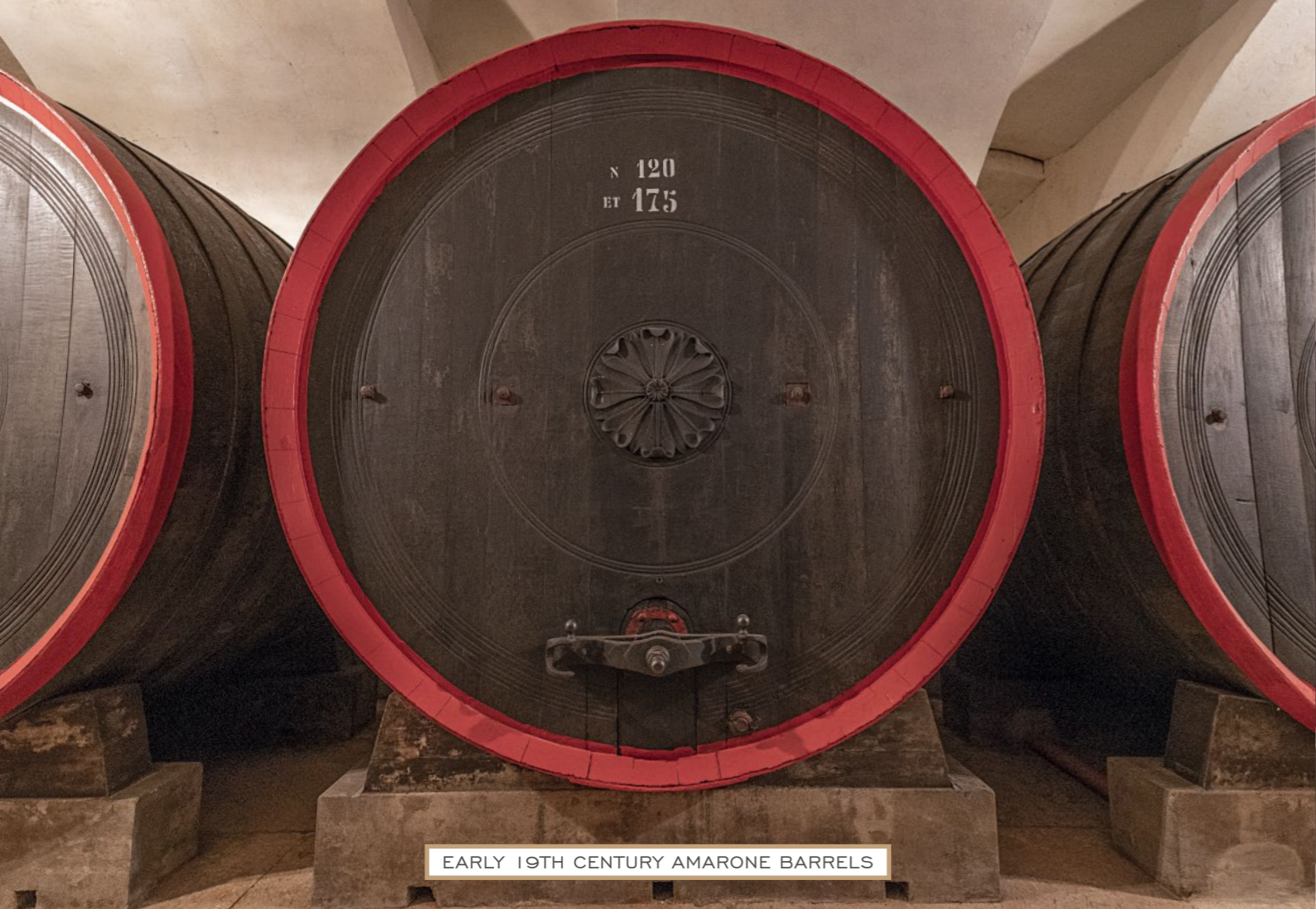
EARLY 19TH CENTURY AMARONE BARRELS