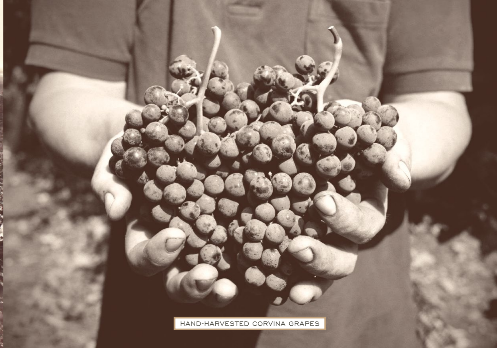
HAND-HARVESTED CORVINA GRAPES