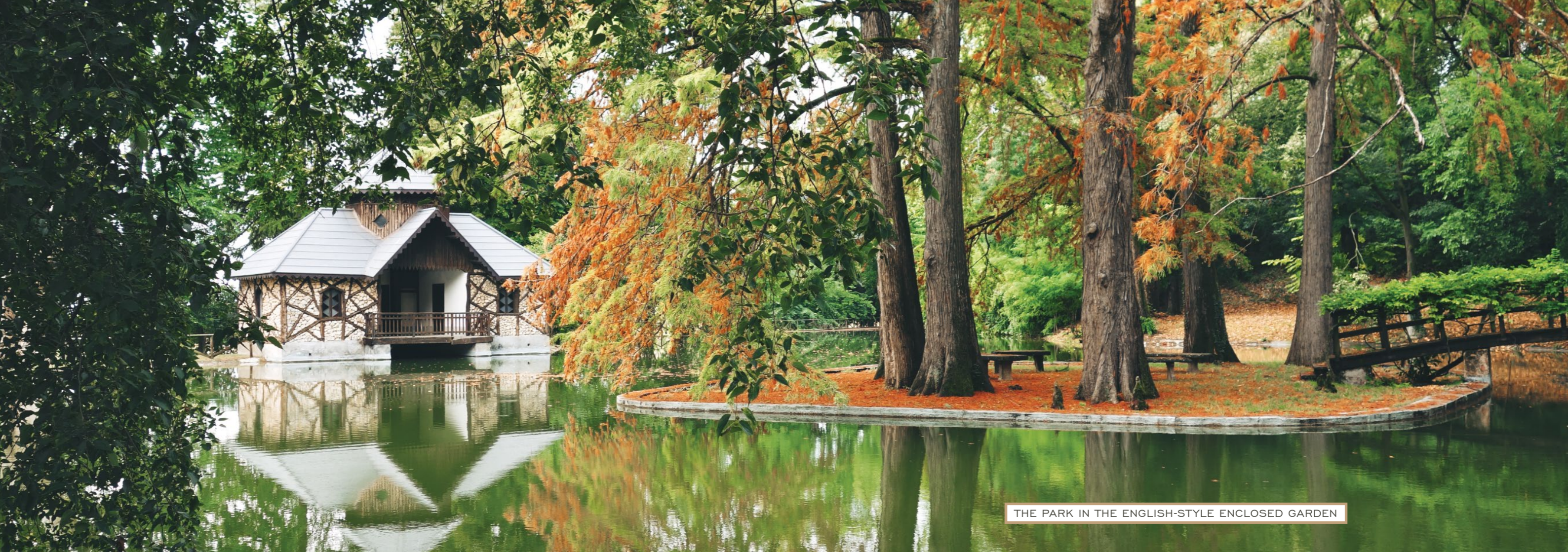
THE PARK IN THE ENGLISH-STYLE ENCLOSED GARDEN