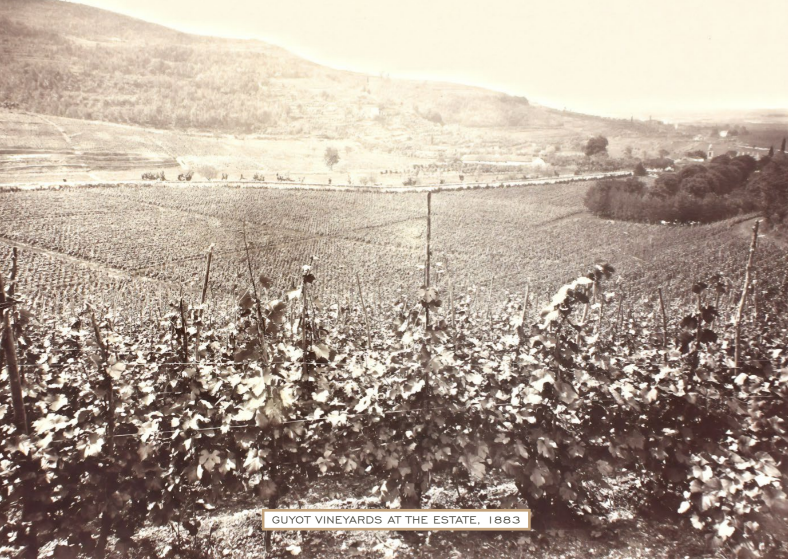
GUYOT VINEYARDS AT THE ESTATE, 1883