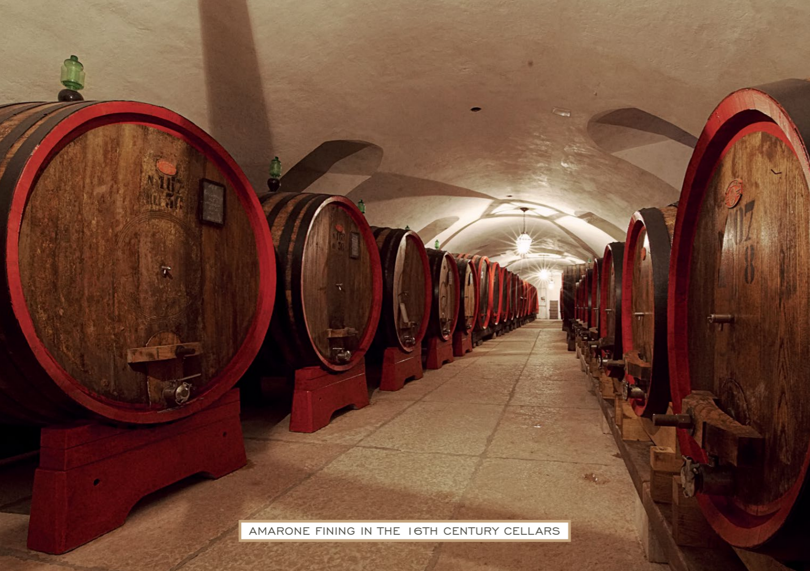
AMARONE FINING IN THE 16TH CENTURY CELLARS