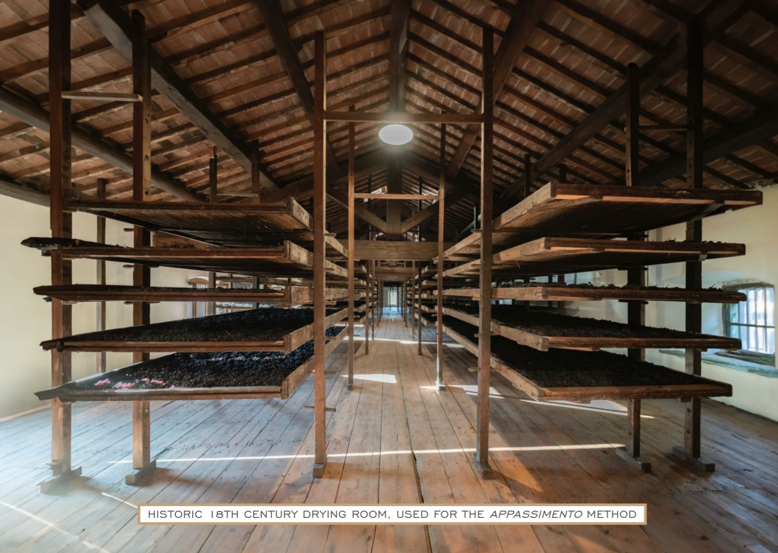
HISTORIC 18TH CENTURY DRYING ROOM, USED FOR THE APPASSIMENTO METHOD