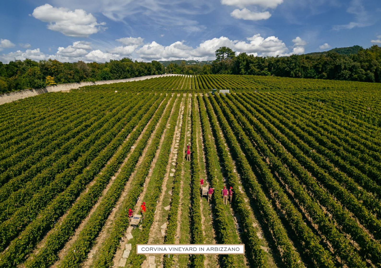
CORVINA VINEYARD IN ARBIZZANO